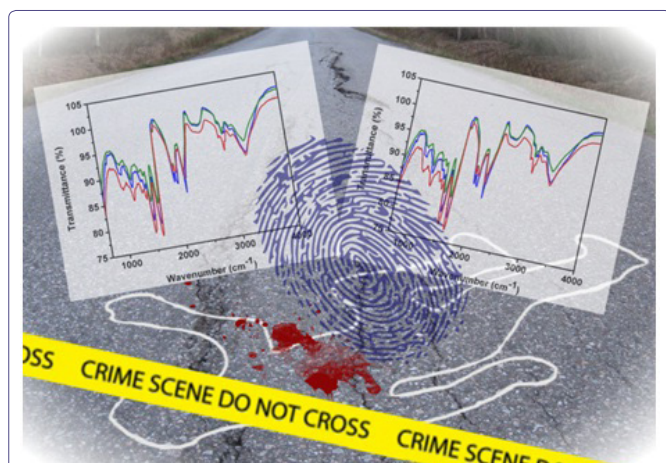
Figure 1: Application of vibrational spectroscopy for the forensic analysis [21].