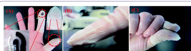
Figure 3: Schematic delineating voltammetry of microparticles at a wearable Forensic Finger . (A) The Forensic Finger exhibiting the three electrode surface screen-printed onto a flexible nitrile finger cot (bottom left inset), as well as a solid, conductive ionogel immobilized upon a similar substrate (top right inset); (B) 'swipe' method of sampling to collect the target powder directly onto the electrode; (C) completion of the electrochemical cell by joining the index finger with electrodes to the thumb coated with the solid ionogel electrolyte [39].

Analysis of traces found at a crime scene often requires very sophisticated instrumentation and specific analytical skills, and is thus performed in specialized laboratories, delaying analytical conclusions