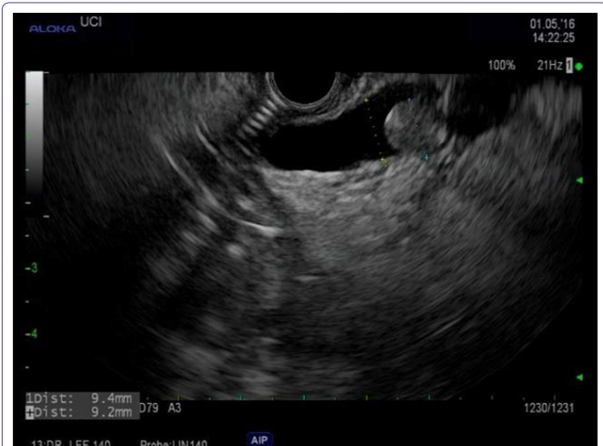
Figure 1: EUS showed dilated pancreatic duct of Santorini (main duct) with mucin ball near the minor papilla.

Pancreatotomy showing floating mucin in the pancreatic duct and the whitish mucin globule