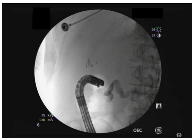
Figure 2: ERCP performed through the minor papilla showed pancreas divisum. Duodenoscope is in long position for the minor papilla cannulation which was done showing dilated main pancreatic duct consistent with pancreas divisum and main duct IPMN.