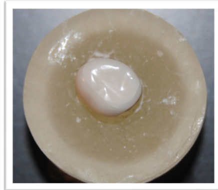
Figure 2: Crown fractured after loading.