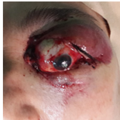
Figure 1: Anterolateral luxation of the left globe and full thickness upper eyelid lacerations.

The patient was informed and written consent was obtained. Then, the patient was brought to the operating room. The globe tried to put back in the anatomic position. The medial rectus was severed 2 mm far from its insertion. Medial rectus was retracted beyond the globe so we could not find the distal part of it. Therefore the proximal part