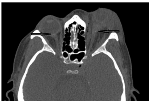
Figure 4: Computerized tomography scan of the patient. Bilateral optic disc drusen showed by black arrow. As it is seen in the CT scan the drusen is far from the left globe. Posterior border of the left globe is shown by white arrow.

of the medial rectus sutured to the bone periosteum of medial wall of the globe. The remainder of other rectus muscles insertions was intact. But the superior rectus was stretched and so it folded over itself and sutured. In the end the upper eyelid was repaired. Postoperatively the globe was in anatomic position and the patient's visual acuity was no light perception. Eye movements were restricted. The right eye examination was normal. It is a very rare case and to the best of our knowledge it is the first case evaluating optic disc head drusen with optic nerve avulsion.