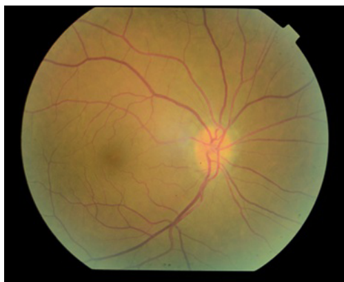
Figure 2: Fundus photograph of the right eye with optic disc drusen.