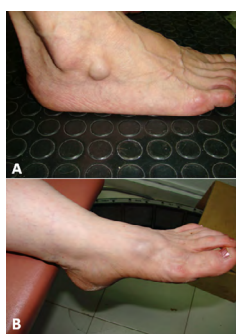
Figure 3: A) 52-year-old patient presented with a compressible mass in the lateral portion of the right venous dorsal foot arch B) 56-year-old patient presented with asymptomatic mass at the left venous dorsal foot arch that cause esthetic discomfort.

In the lower extremities there was 12 patients, seven men and five women, the age range was 18-62 years of age, the presentation was a painful nonpulsating mass in 5 patients, thrombosis in 1 patient, acute edema in 1 patient, aesthetic discomfort in 1 patient and in 5 patients with an asymptomatic nonpulsating mass. The most common location was the great saphenous vein (right: 7 patients) (Figures 3 and 4) Just the patient with acute edema required an angio-TAC beside the vascular ultrasound. Average aneurysm size was 4cm ranging from 3.8 to 12.4 cm. All the patients received a surgical treatment consisted in resection of the venous aneurysm. There were no complications and the evolution was good.