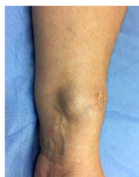
Figure 2: 38-year-old patient presented with painful mass at the right forearm. The lesion corresponded to an aneurysm of the right radial vein external.