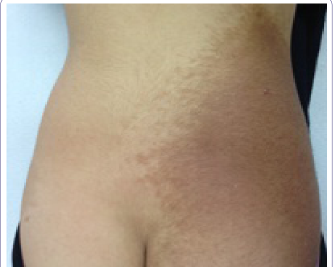
Figure 2: Hypertrichosis over the hyperpigmented patch on the right lumbar area.

polymerase chain reaction of androgen receptor messenger RNA and ligand-binding assays in BN. Hypertrichosis and acneiform lesions on the BN may support the role of abnormal androgen receptor activity [3].