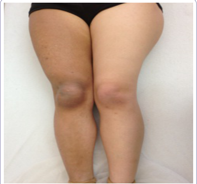
Figure 1: Wide hyperpigmented patch on the right lower extremity.

Received: January 02, 2015; Accepted: March 20, 2015; Published: April 03, 2015