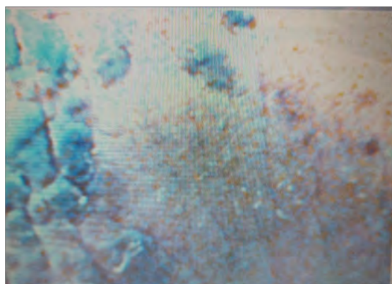
Figure 2: 60x magnification showing scales with pigmented skin.

Videodermatoscopy was done using Aram Huvis® videodermatoscope with 1x, 60x (Figure 2), 200x (Figure 3), 1000x (Figure 4) with Skin XP Pro software system.