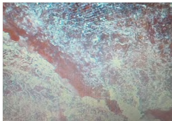
Figure 4: 1000x magnification showing deep fissures with dry scaly skin.