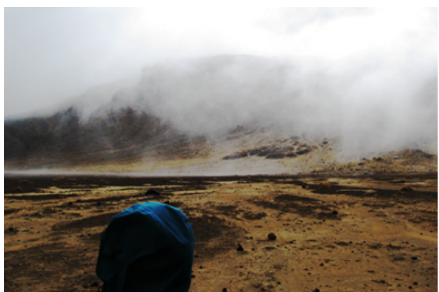
Figure 3: Coandă Effect at the Tongariro Crossing, under a strong east wind. Note the line of Coandă vortices and a complete vortex forming to the right of the line (A. Bunn, 2008).

plateau. While thus immobilized, a second phenomenon impacted. The impenetrable cloud began receding evenly from me. When I pivoted, the recession was occurring all around me, like a camera iris opening. In a minute, I was standing in the centre of a golden dome, doubtless caused by a clear-air vortex grounding on my position. At the time I was unaware of the Coandă effect and the mountain-top phenomena were preternatural.