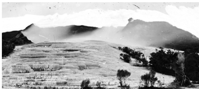
Figure 2: White Terrace, under a strong north wind (cropped). Steaming-fog may be blowing across the southern Terraces. 1885, Burton, Te Papa (C.014925).

plateau. While thus immobilized, a second phenomenon impacted. The impenetrable cloud began receding evenly from me. When I pivoted, the recession was occurring all around me, like a camera iris opening. In a minute, I was standing in the centre of a golden dome, doubtless caused by a clear-air vortex grounding on my position. At the time I was unaware of the Coandă effect and the mountain-top phenomena were preternatural.