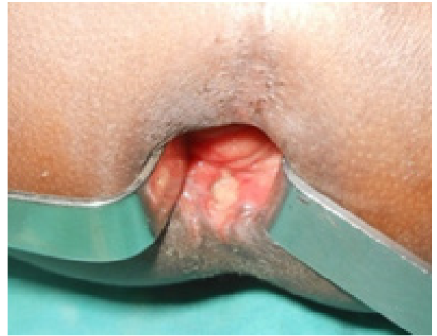
Figure 5: Deep wound at the posterior wall of anal canal in the boy of 2.5 years old (Patient 4).