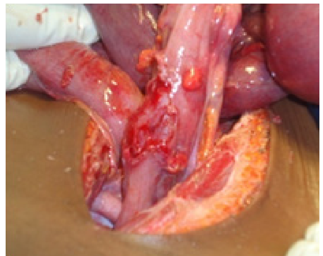
Figure 6: Sigmoid colon perforation by impalement in the boy of 13 years old (Patient 2).