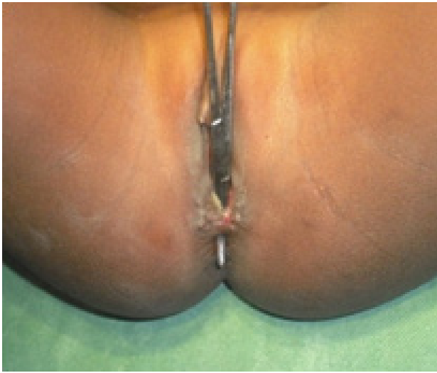
Figure 3: Rectovaginal fistula, showed by the clip after cutting of stitches (Patient 3).