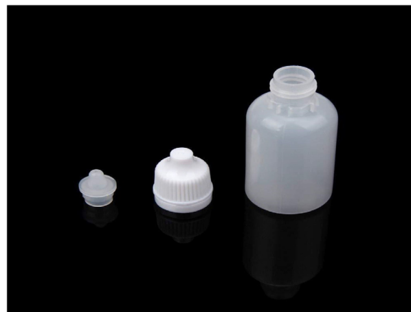
Figure 1: Picture of 10ml plastic squeezable dropper bottle from Bleiyou.

patients at 3-month follow-up (Figure 2). Mean IOP reduction in the left eye was significant ( p=0.031 ) after 3 months of compounded solution use when compared with baseline (Figure 2B). The utilization of the combination therapy was more effective at lowering IOP than administration of each of the medications separately. Further, this method allows for the use of personalized medications that are accessible by patients and covered by insurance. No adverse events were noted. Patients reported better compliance and reduced hyperemia. Given that none of the doses were changed, it is reasonable to assume that the compounded therapy was more effective because patients demonstrated increased persistency of use. Adherence rates in glaucoma are low compared to the treatment of other chronic illnesses [5]. Use of one medication twice daily reduces user error, saves time, and is easier to adhere to than several individual drugs. Compounding is also cost-effective, allowing patients more time between refilling medications. Patients are also exposed to fewer preservatives, which can result in eyelid erythema, follicular hyperplasia, conjunctival hyperemia, and dry-eye like symptoms [4,6].