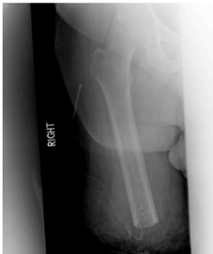
Figure 1: AP radiograph of the right femur following transfemoral amputation with drill holes in the distal femoral diaphysis for the adductor myodesis.

** Minimal number of steps can be taken without prosthesis