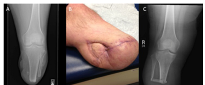
Figure 2: (A) AP radiograph of the knee following transtibial amputation. (B) Clinical picture of a healed transtibial amputation using a long posterior myocutaneous flap that required skin grafting for complete coverage. (C) AP radiograph of the knee following the Ertl technique performed during a transtibial amputation.