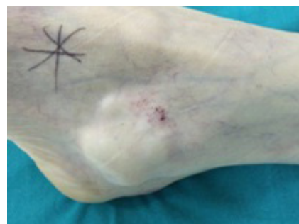
Figure 1: Swelling around the lateral malleolus.

Physical examination can reveal swelling with tenderness. Upon palpation, a cyst can be soft or firm or movable or fixed. A visible lesion is covered with normal skin, which is not red or warm (Figure 1) [4].