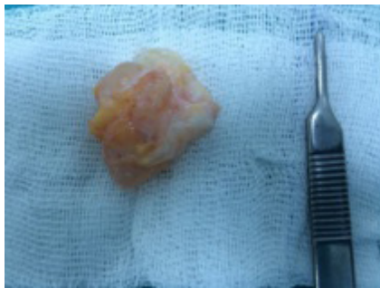
Figure 2: The lesion was observed as a well-circumscribed, yellowish, lobulated mass upon macroscopic examination.

Macroscopically, ganglion cysts appear as a round or oval lesion with multilobulated margins that are filled with mucinous fluid (Figure 2). Pathological findings relating to ganglion cysts include proteinaceous material surrounded by dense fibro-connective tissue without the presence of synovial epithelium when stained with hematoxylin eosin (Figure 3).