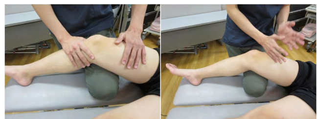
Figure 2: Examples of massage interventions; effleurage (left) and tapotement (right).

Two testing sessions were separated by 72 hours at least, in order to minimise the effects of delayed onset muscle soreness. Each session was held at the same time of day. All testing sessions were conducted in the same room at the same room temperature of 22 degrees Celsius. Participants had been instructed to wear a short sleeve T - shirt and shorts in the experiments. The first author organised all the sessions, performed massage interventions and assessments for all the subjects. Care was taken to ensure that all participants received the same verbal instructions and visual cues to minimise potential effects on arousal levels. This trial was registered in University Hospital Medical Information Clinical Trials Registry (registration number: UMIN000025962) in advance.