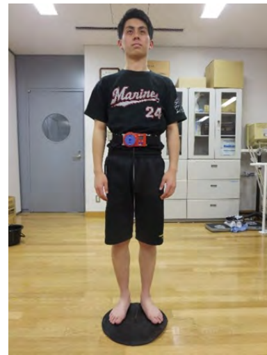
Figure 1: Assessment of vertical jump height using the jump meter.