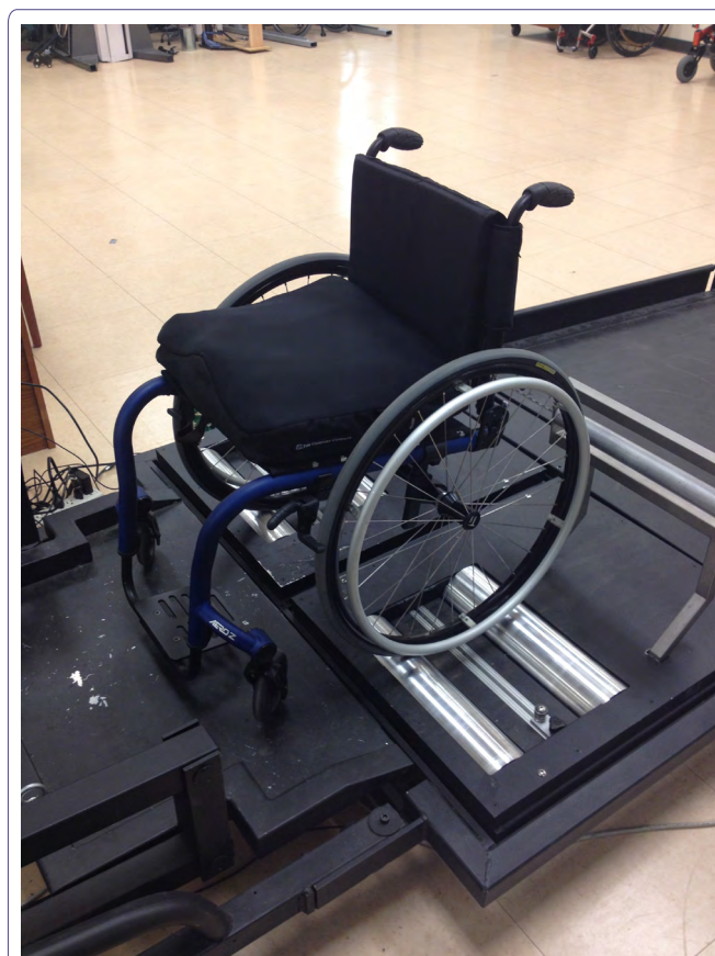
Figure 1: Wheelmill System.

The Microsoft Kinect sensor is a portable, inexpensive motion sensing device that can be used in conjunction with a personal computer to monitor the three-dimensional position and orientation of a person's body segments without the use of reflective markers or wearable devices [42]. The Microsoft Kinect was shown to have strong concurrent validity with multiple camera 3D video motion analysis software in a study on postural control [42]. During data collection,