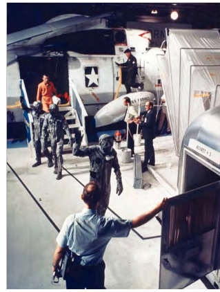
Figure 1: The Apollo 11 crew, on US Hornet, July 24, 1969.

On July 24, 1969, on the day of arrival on earth, after an eight day journey to the moon, Neil Armstrong, Michael Collins and Edwin Aldrin were observed on television by millions as they stood up without assistance, showed no signs of physical or psychological distress and walked normally on the deck of the aircraft carrier USS Hornet before entering the quarantine bus [4] (Figure 1). Soon afterwards they were observed to be relaxed, smiling, exchanging words with president Nixon, again without any sign of distress [4] (Figure 2). They did not seem to show any physical signs or symptoms associated with an eight daylong space travel, no evidence of fatigue, impaired balance, muscle weakness, dizziness, altered mood and mental function.