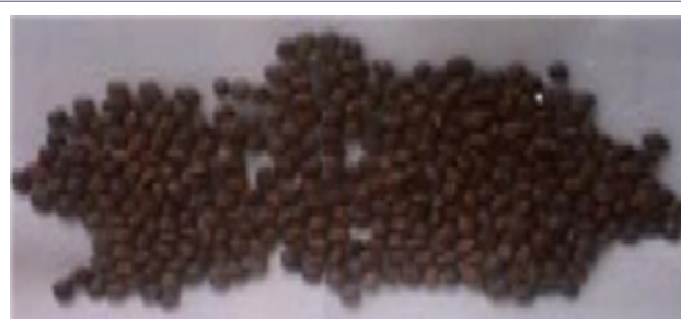
Figure 2: Dark-Ash Solojo Cowpea.