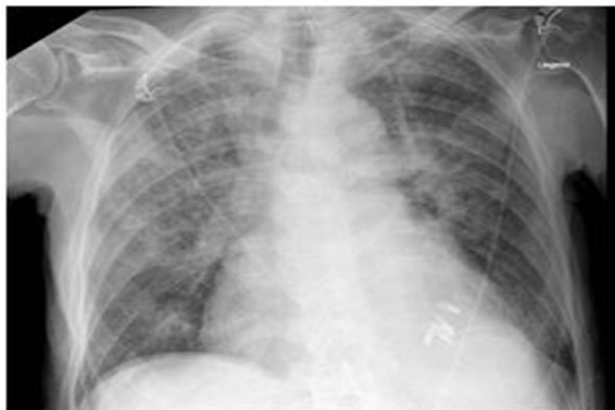
Figure 2: Chest radiograph findings. Follow-up chest radiograph 3 days after initial presentation showed diffuse signs of pulmonary venous congestion with residual interstitial edema but almost complete resolution of the dense consolidations.

with severe mitral valve insufficiency [1,2]. However, unilateral pulmonary edema has also been described in other conditions, for example in acute and chronic heart failure or in patients with leakage following mitral valve repair (reviewed in [2]). The predilection of unilateral pulmonary edema to the right side is explained by several mechanisms - in the context of mitral valve insufficiency it might be due to the anatomic relation of mitral valves and the pulmonary veins resulting in penetration of the thin-walled right upper pulmonary vein by the regurgitation jets [3].