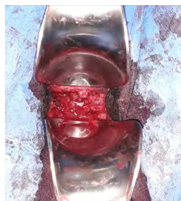
Figure 4: Macroscopic appearance of the vaginal fund during enlargement vaginoplasty properly presenting to specific Dupuytren technique (patient 3).

Two patients had undergone enlargement surgery using the Dupuytren technique (Figure 4). Another patient chose non-surgical treatment with progressive vaginal dilation using Frank's method. The fourth was advised to continue intercourse, as she had already achieved a vaginal length of 7 cm with this procedure. Psychosexual follow-up was provided by the surgical team. These different treatments had made it possible to obtain, within 5 months, a vaginal length of 9 cm on average for the Dupuytren method (Figure 5) and 7 cm for the Frank method. Sexual satisfaction was noted by all patients. Infertility, however, remained a major concern in current follow-up.