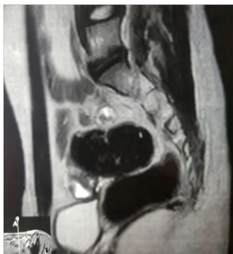
Figure 2: MRI profile section showing absence of the uterus with visible presence of two ovaries (Patient 3).