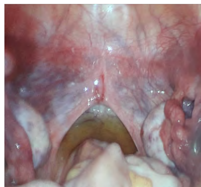
Figure 3: Laparoscopic aspect showing the absence of uterus and presence of ovaries (Patient 3).

Two patients had undergone enlargement surgery using the Dupuytren technique (Figure 4). Another patient chose non-surgical treatment with progressive vaginal dilation using Frank's method. The fourth was advised to continue intercourse, as she had already achieved a vaginal length of 7 cm with this procedure. Psychosexual follow-up was provided by the surgical team. These different treatments had made it possible to obtain, within 5 months, a vaginal length of 9 cm on average for the Dupuytren method (Figure 5) and 7 cm for the Frank method. Sexual satisfaction was noted by all patients. Infertility, however, remained a major concern in current follow-up.