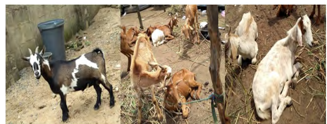
West African Dwarf Sokoto Red White Sahel Figure 1: West African Dwarf, Sokoto Red, White Sahel.

There are over 300 distinct breeds of goat [3]. Goats are one of the oldest domesticated species, and have been used for their milk, meat, hair and skin over much of the world [4]. In 2011, there were more than 924 million live goats around the globe, according to the UN Food and Agriculture Organization [5]. The West African Dwarf goat breed is from coastal west and central Africa. The West African Dwarf goat breed probably evolved in response to the conditions in the humid Forest of West Central Africa [6]. The breed is known by some other names in different parts of the world such as African Dwarf, Chevrenainede Savanes, Cameroon Dwarf, and Dwarf West Africa. There are many types of West African dwarf goats available. This goat plays a very important role in the rural economy of West Africa. Most of the poor and small scale farmers in this region raise them (Figure 1).