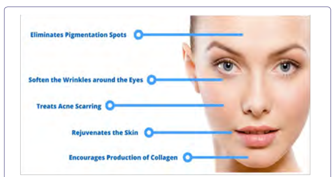
Figure 5: There are various doses that can be used on a person's skin during cutaneous acupuncture (Microneedling). The average dose of CBD is 15 mg on a 9 x 9" area of skin surface. The body is stimulated by the acupuncture with CBD and Hyaluronic acid, by also producing collagen and elastin resulting in smoother, firmer and rejuvenated skin.

In addition, because CBD oil contains omega-3 and omega-6 fatty acids, it provides moisture and protection from sun damage (Figure 5).